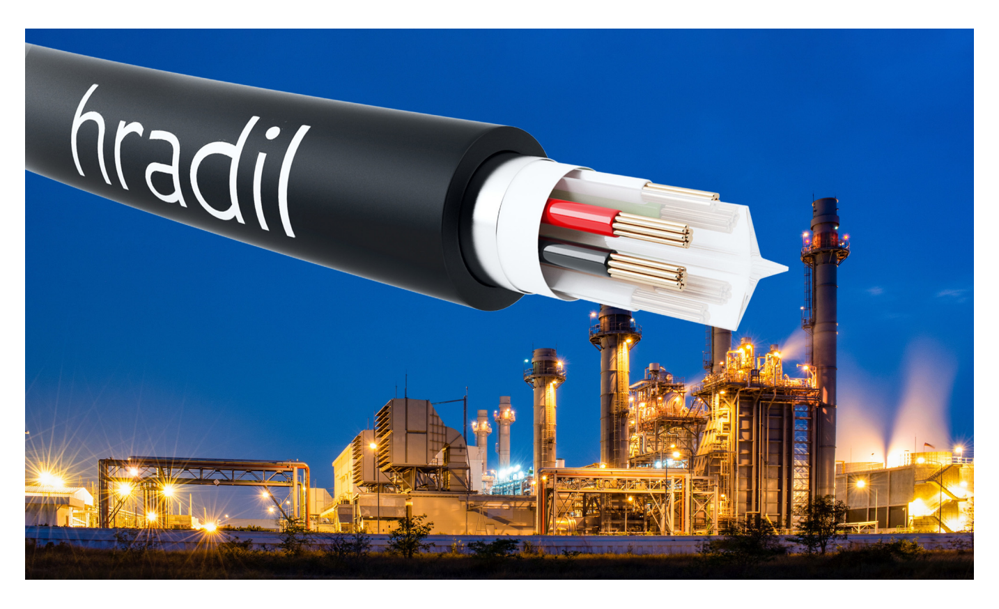
Fig. 1: The HRADIL high-performance hybrid cable unites four important qualities: Power chain capability, rugged outdoor credentials, Ethernet and power transmission capability

According to Alfred Hradil, Managing Director at HRADIL Spezialkabel, "today, more and more industry users are demanding cables that are very versatile". Whether for reasons of cost or maintenance, or to save space: tasks, which in the past were performed by several cables, are combined today in a single hybrid cable. This can only be accomplished, however, where the technical design and use of material permit the combination of several functions in a single cable. For the very first time, HRADIL now offer a hybrid cable which brings together four properties or capabilities in a single cable: Ethernet according to Cat5e to transmit real-time data up to 1,000 Base-T, power transmission up to 125 volts, rugged outdoor characteristics to survive many years of use even in extreme climatic conditions and also highly-developed energy chain capabilities designed to withstand extreme tensile and torsional loads.