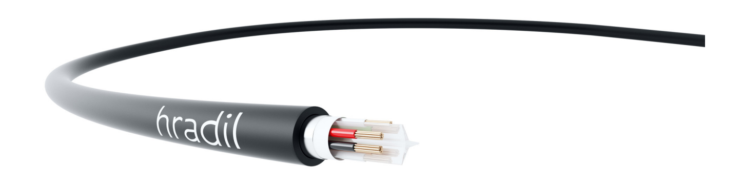
Fig. 2: HRADIL High-performance hybrid cable for Ethernet and power transmission