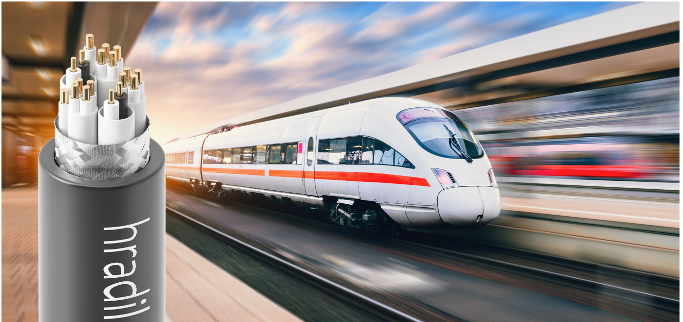
Fig. 3: HRADIL High-Endurance CAN Bus Hybrid Cable for rail vehicles (For larger view, please click on image)