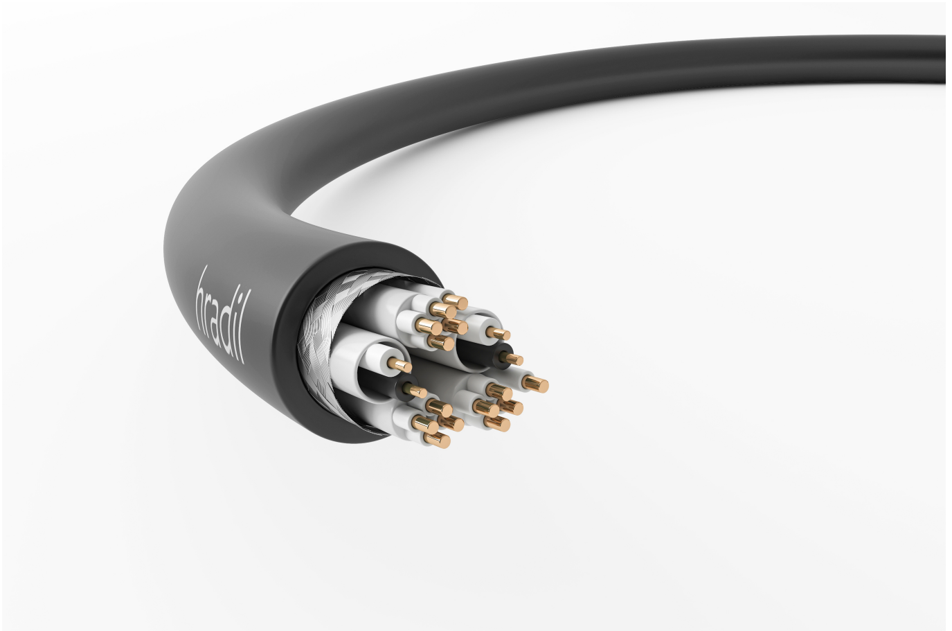
Fig. 2: Hybrid Cable for Rail Vehicles by HRADIL (For larger view, please click on image)

HRADIL's CAN bus hybrid cables have been designed for rugged outdoor use, withstand long-term temperature exposure in the range from -50 to +90 degrees C and are resistant against oil and fuels in accordance with the EN 60811-504 and EN 60811-404 standards. Ozone resistance in accordance with EN 50306-4 is guaranteed. In the case of fixed cabling it permits a bending radius of six times the external diameter. Special compounds are used to produce the high-endurance cable. Aramide fibre braiding provides for tensile strength of the jacket and the inside of the cable.