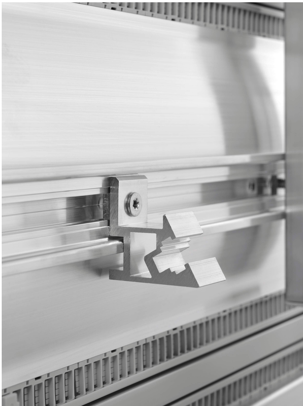
Fig.1: LÜTZE AirSTREAM angle adapter KSS fixed on the hat rail